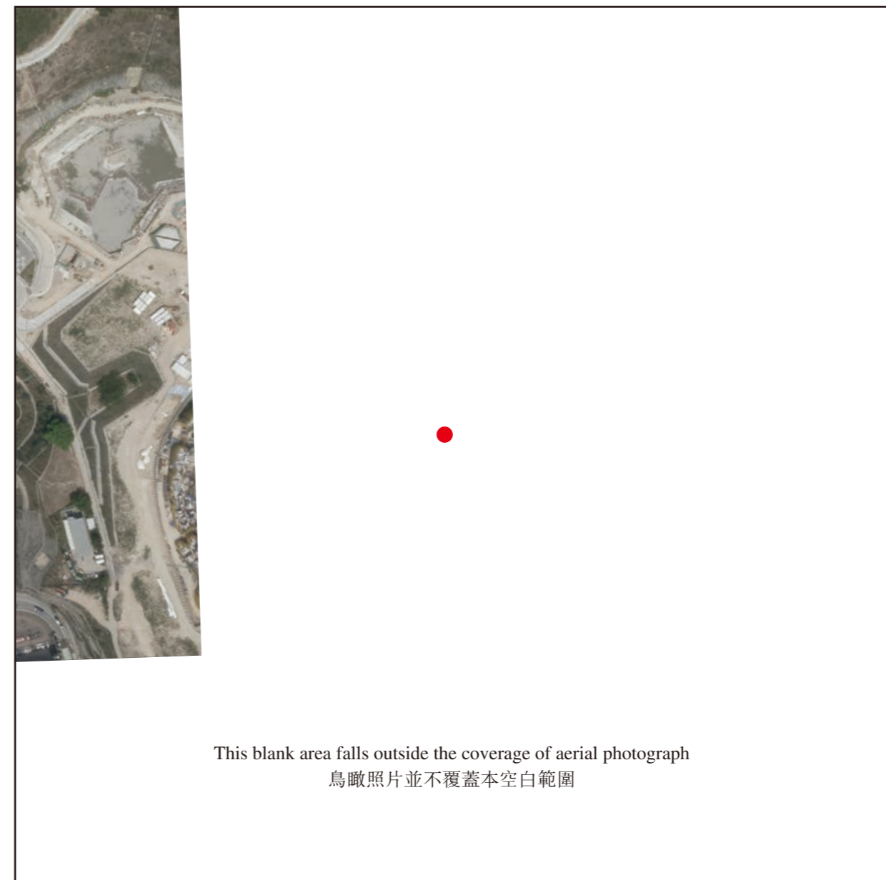
● Location of the Development 發展項目的位置

Adopted from part of the aerial photograph taken by the Survey and Mapping Office of the Lands Department at a flying height of 2,000 feet, photo no. E220165C, dated 20 March 2024.